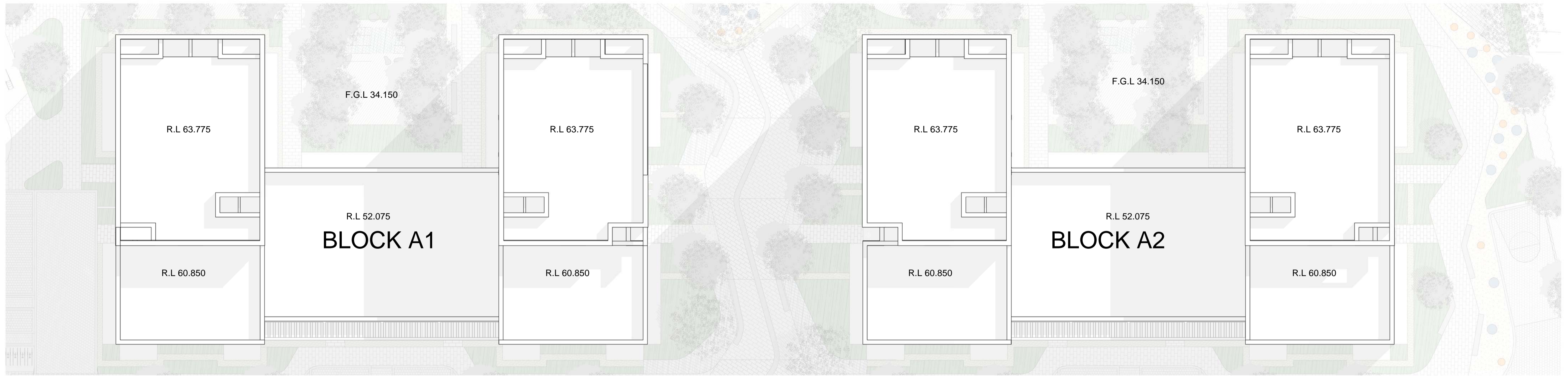
1 Site Plan 1 : 200